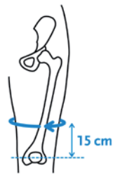
Thigh circumference 15 cm (6") above mid patella